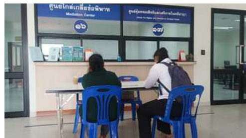
AAT lawyers accompanied beneficiaries to court.