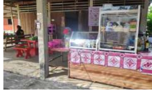
AAT supported fund for a noodle shop to a beneficiary's mother.