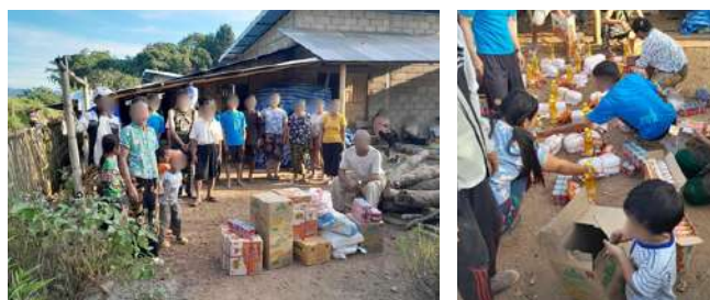
People received emergency support from AAT.