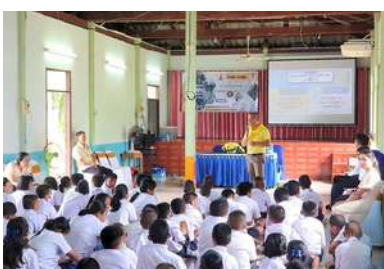
Training students in Satun province