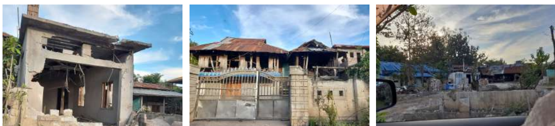
Homes and areas destroyed during the armed conflict in Myanmar.