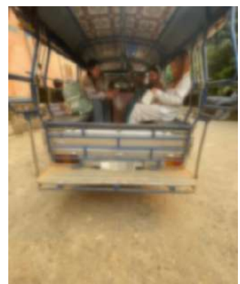
AAT facilitated the safe return of women and girls to their home.