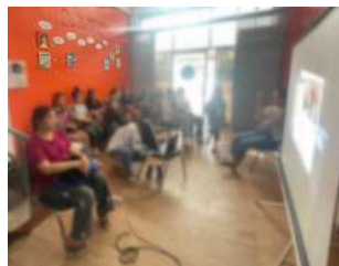
AAT along with LFTU gave training to our beneficiaries and volunteers.