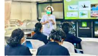
Beneficiaries attended nursing assistance class.