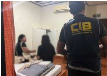
AAT and police rescued girls out of sexual exploitation situation.

We receive information about cases of sexual violence through our volunteer network and partner organizations, or by conducting our own fact finding—both online and in the field—to identify victims and gather evidence. Once a victim is located, we carry out rescue operations to remove her from the site of exploitation and ensure her safe transfer to a secure location.