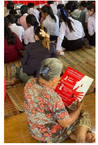
AAT along with LFTU gave training to at risk communities.