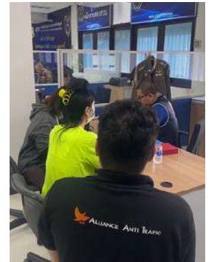
AAT accompanied Thai victims who were trafficked in Dubai to file complaint against trafficker.