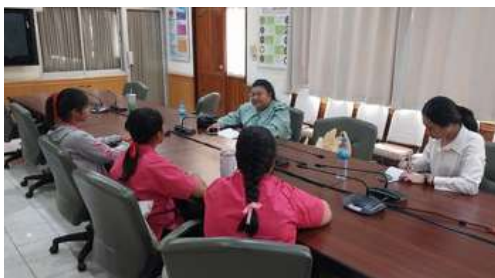
AAT lawyers visited beneficiaries at a government shelter to follow up on the cases