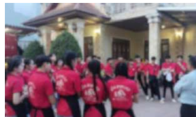
A Lao beneficiary whom AAT helped for career opportunities. She works in a restaurant.