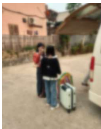
AAT facilitated the safe return of women and girls to their home.