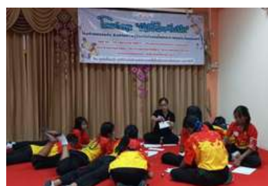
Training students in Ubon Ratchathani province