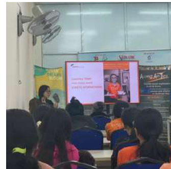
AAT and Streets International organized a career orientation activity for parents of children in the project "Where Dreams Bloom"