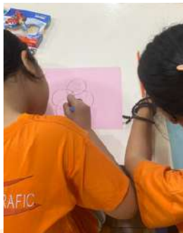
AAT organized a meeting with the girls in the "Where Dreams Bloom" program to help them discover more about themselves