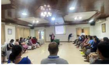
AAT along with LFTU gave training to local authorities and AAT volunteers.

In Laos, 927 individuals from at-risk communities received knowledge and guidance on harm prevention and protection strategies—particularly in relation to sexual exploitation and forced marriage—through the efforts of community leaders, government representatives, and volunteers.