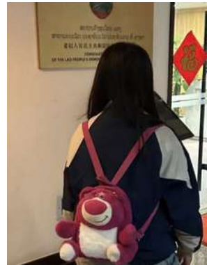
Lao victim travelled to the Lao Embassy in China for their repatriation back home.