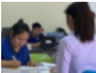
Lao beneficiary registered at the university after having passing the exams.