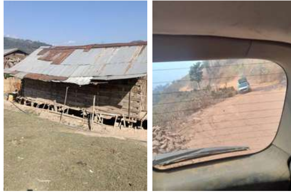
AAT staff travelled to visit and follow up our beneficiaries who are in remote areas.