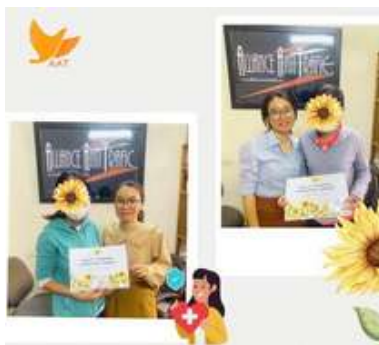
AAT provides health insurance cards.

In Vietnam, AAT conducted outreach programs targeting young women in prostitution to encourage them to leave prostitution and support alternative employment and provide crucial health services. AAT reached 3,021 young women and provided health insurance support and sexual health services to 2,418 of them.