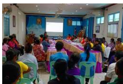
Training for people in communities in Nang Rong district, Buriram province