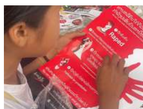
Students in groups learn about sexual exploitation, forced marriage from our volunteers