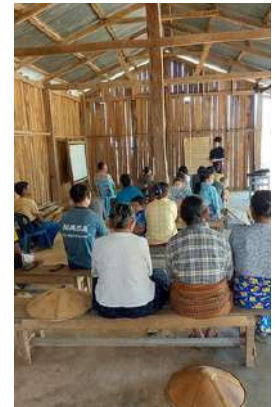
AAT's volunteers in Shan state, Myanmar, gave training to people in communities.