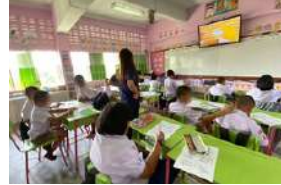
AAT' volunteers assisted teachers in