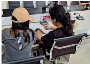
Victims are at the safe place for victim identification process.