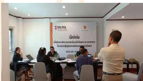
The lawyers / legal officers attended learning sessions and exchange meetings in Thailand.