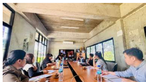
The lawyers / legal officers attended learning sessions and exchange