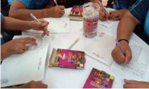
AAT organized activity to the beneficiaries where they can write their emotion and diary each day