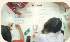
AAT provides training to students and teachers in Northeastern Thailand, where many children are at risk of online sexual violence.