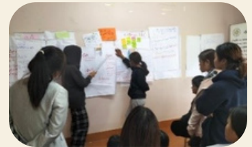
AAT's beneficiaries and volunteers attend a training organized by AAT and Lao Federation of Trade Union.