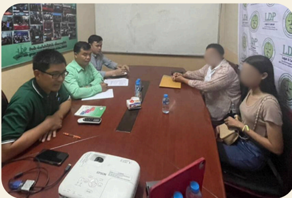
LDP meets with victims