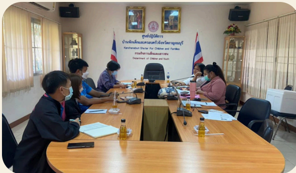
AAT and relevant agencies discuss legal options for victims.