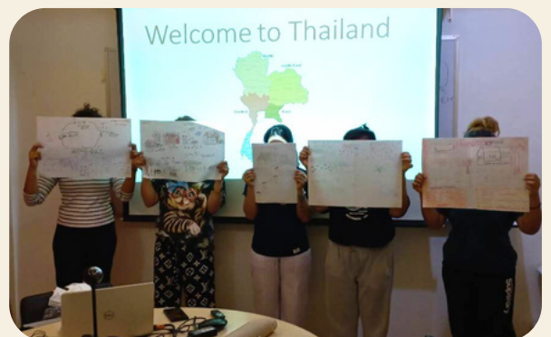
AAT provides information on Thai legal procedures and introduces reintegration services to victims.