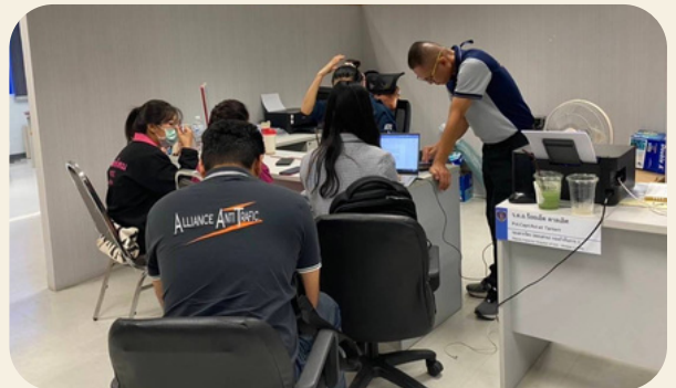
victims supported by AAT provide a statement to the court.