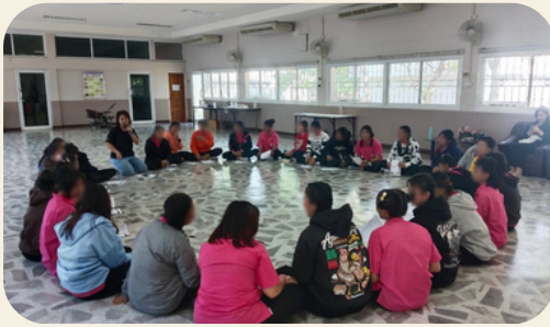
AAT organizes a service in a government shelter.

AAT provided career support to 22 beneficiaries.