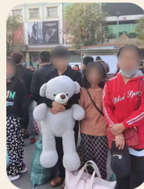
A Burmese victim and her children travel to the China – Myanmar border to go back home.