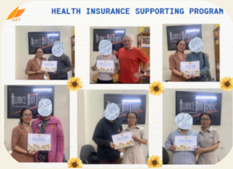
AAT provides health insurance cards.

In Vietnam, AAT conducted outreach programs targeting young women in prostitution to support alternative employment and provide crucial health services. AAT reached 2,807 young women and provided health insurance support and sexual health services to 2,479 of them.