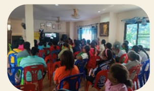
AAT gives a training to communities in Northeastern Thailand.