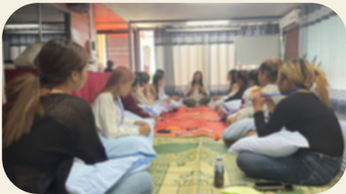
AAT's beneficiaries and volunteers in therapy session.

AAT provided career support to 14 beneficiaries.