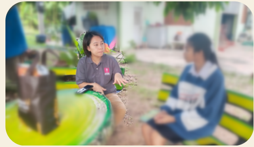
AAT follows up with a program beneficiary to provide educational support.