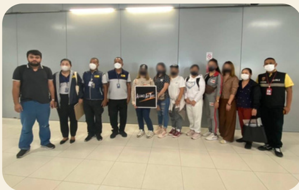
AAT and Thai government officials receive Thai victims returning from Benin at Bangkok's airport.