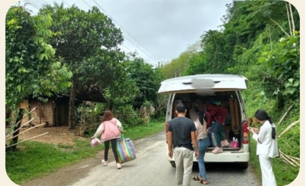
AAT facilitates the safe return of women and girls in Laos.