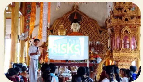
AAT volunteers train students and community members.