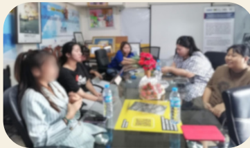
AAT's volunteers attend a learning session with Thai NGOs.