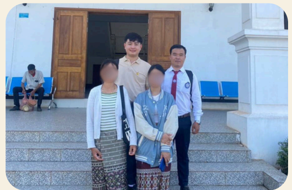
LDP and victims at the courthouse.