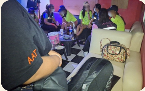
AAT rescues six Thai minor girls from a resort in Phetchabun province located in Northeastern Thailand.