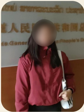
A Lao victim travels to the Lao Embassy in China for assistance.